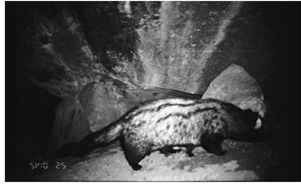
PLATE 1 Camera-trap photograph of common palm civet Paradoxurus hermaphroditus from Nuristan Province. Identification was confirmed by Dr Geraldine Veron, Museum National d'Histoire Naturelle, Paris, France.

Verified photographs (Plate 1) and phylogenetic analysis of collected scats confirm the presence of the common palm civet in Nuristan. This constitutes a significant extension to the west of the species' known range. DNA analysis of two scats collected at 1,400 and 2,500 m were identified as Paradoxurus spp. Of the species of Paradoxurus the com-